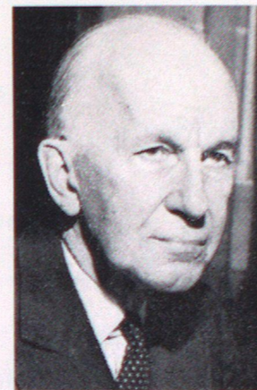
RT. HON. VINCENT MASSEY